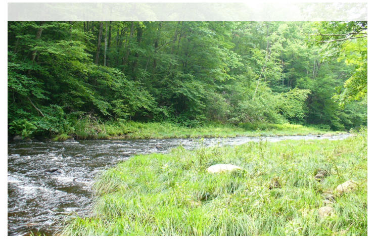
Storm water overflow