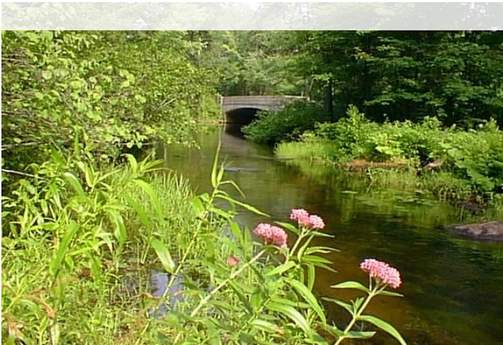
Nissitissit River, Brookline

9 out of the 13 NRPC communities mention protecting existing water infrastructure in their Master Plans