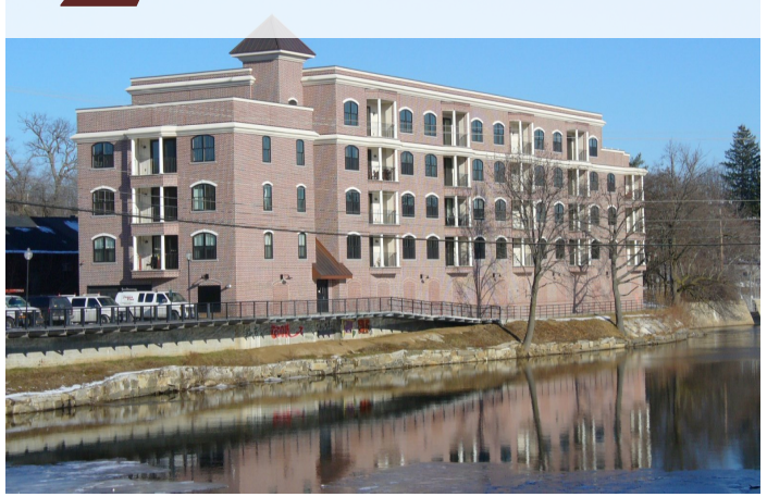
Jackson Falls Condominiums, Nashua