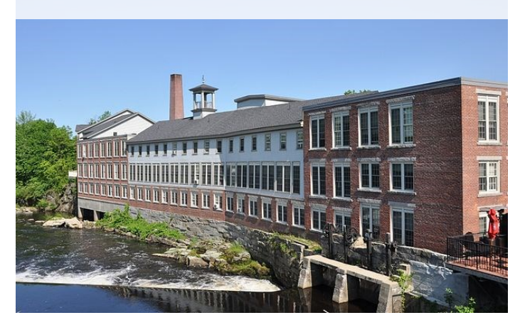
Lindsey Landing Affordable Housing development in Milford

In the NRPC Region, 12 of the 13 communities specifically address affordable or workforce housing.