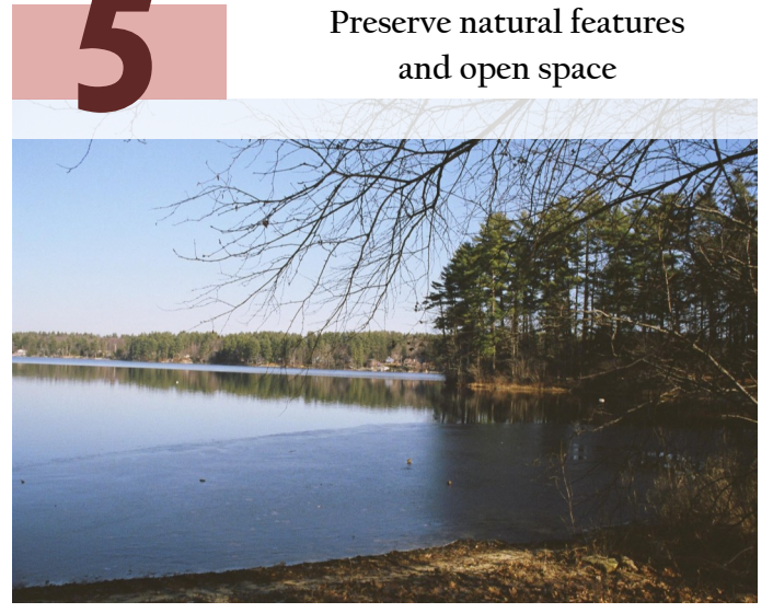
Baboosic Lake, Amherst

In the NRPC Region, 9 out of 13 communities mention preserving open space and natural features in housing developments