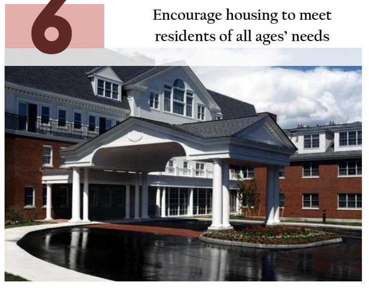
Senior housing in Nashua

In the NRPC Region, 10 out of the 13 communities encourage housing supply to meet the needs of all ages groups